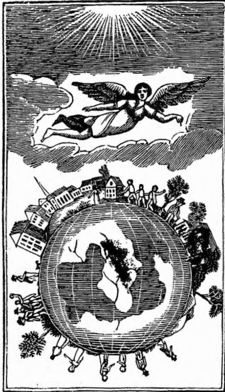
See Tale Thirteen.