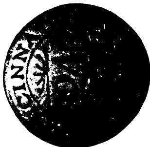
BADGE USED IN CINCINNATI.