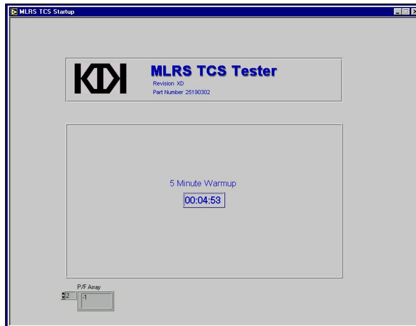
Figure 1. Startup Screen

opens up a comma delimited initialization file that I created with Wordpad. Stored in this file are all the test parameters and tester information such as part number and software revision. The software puts these strings into global variables for use during the test. The software then performs a self test on all the equipment to verify they pass self test. After the self test, the screen prompts the user to verify the correct date and time and gives them the option to change it if necessary. See figure 1.