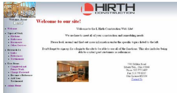
Figure 3. Administrator Welcome Page

The administrator can do and see all of the above and go to an administrator page with more tools. Here the administrator can manage the user database and the photo database. The stats page can be viewed to monitor the traffic to the site.