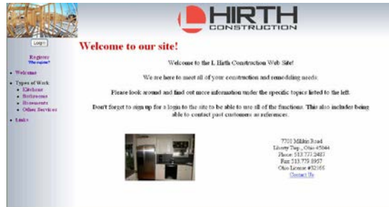
Figure 8. Welcome Page