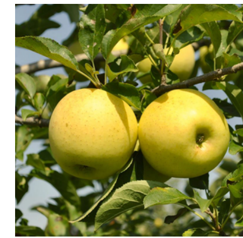
(Stark Golden Delicious Apple Tree)