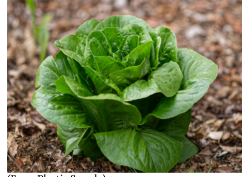
(Farm Plastic Supply)