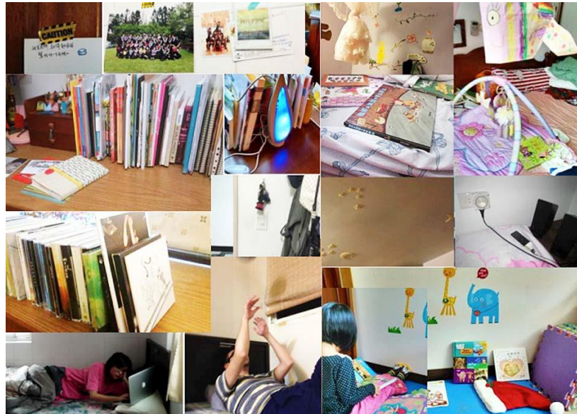
Figure 1. Some of the photos collected in the field studies.

did not work all the time and they still have not found the effective solutions. With the ubiquitous technology of smart home, we might be able to create interactive activities that could attract children's attentions and assist them to create the rituals from children's perspectives.