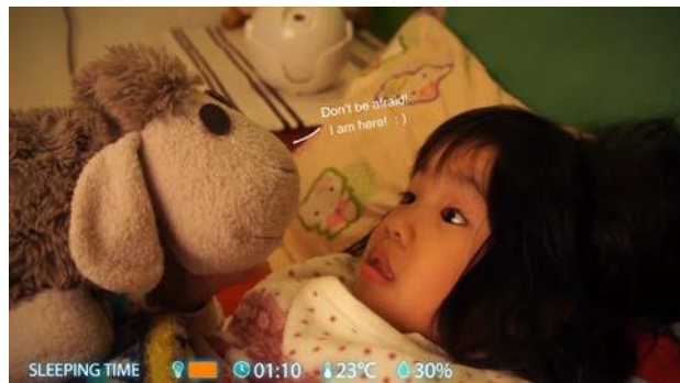
Figure 3. The concept of calming down children in midnight.

Comparing to physical prototyping, the use of video prototyping enabled us to demonstrate the designs of user experience with an easily understandable format. It also assisted designers to explore the various possibilities in creating the human-system interactions. One example was in the nightmare scene (shown in Figure 3). The avatar was able to sense and monitor the child sleeping. When he/she unexpectedly woke up from a nightmare, the avatar could trigger specific lighting and sound (e.g. parents' voices or soft music) to comfort him/her. This could probably help to guide him/her into sleeping again.