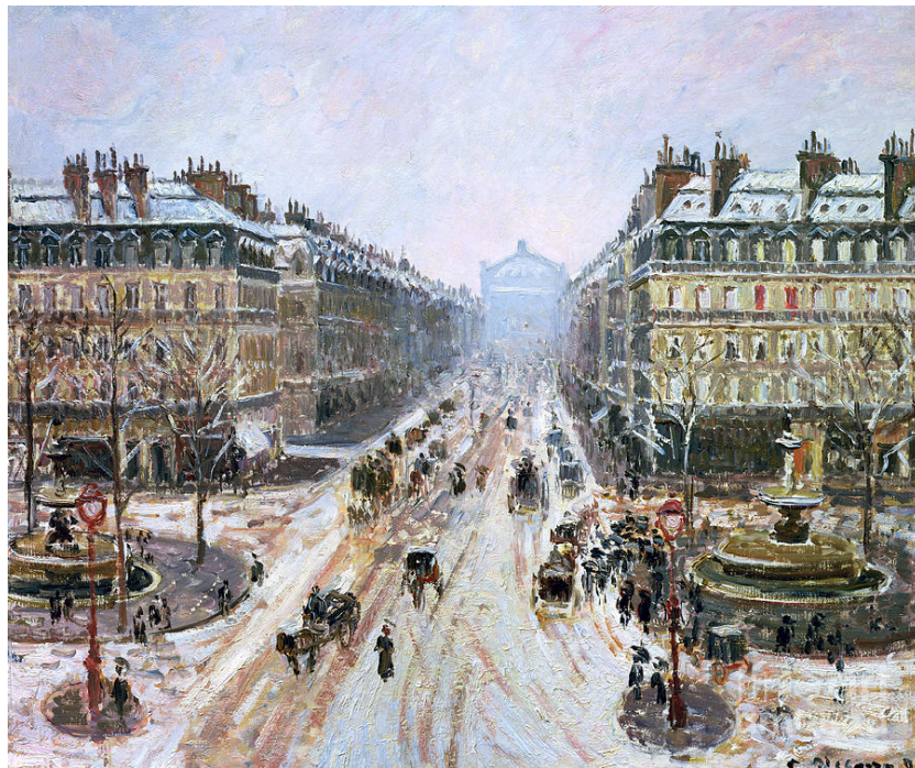
Figure 5. Camille Pissarro, Avenue de l'Opera - Effect of Snow , 1898, oil on canvas, 54 x 65 cm., Private Collection