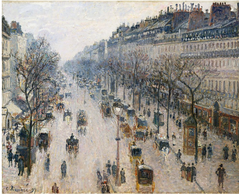
Figure 1. Camille Pissarro, Boulevard Montmartre Winter Morning , 1897, oil on canvas, 25 1/2 x 32 in., Metropolitan Museum of Art, New York City