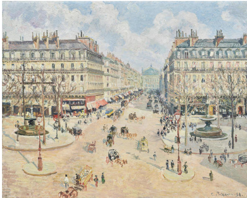
Figure 5. Camille Pissarro, Avenue de l'Opera - Morning Sunshine , 1898, oil on canvas, 65 x 81 cm., Private Collection