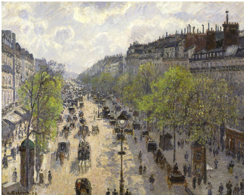
Figure 3. Camille Pissarro, Boulevard Montmartre Spring , 1897, oil on canvas, 65 x 81 cm., The Israel Museum, Jerusalem