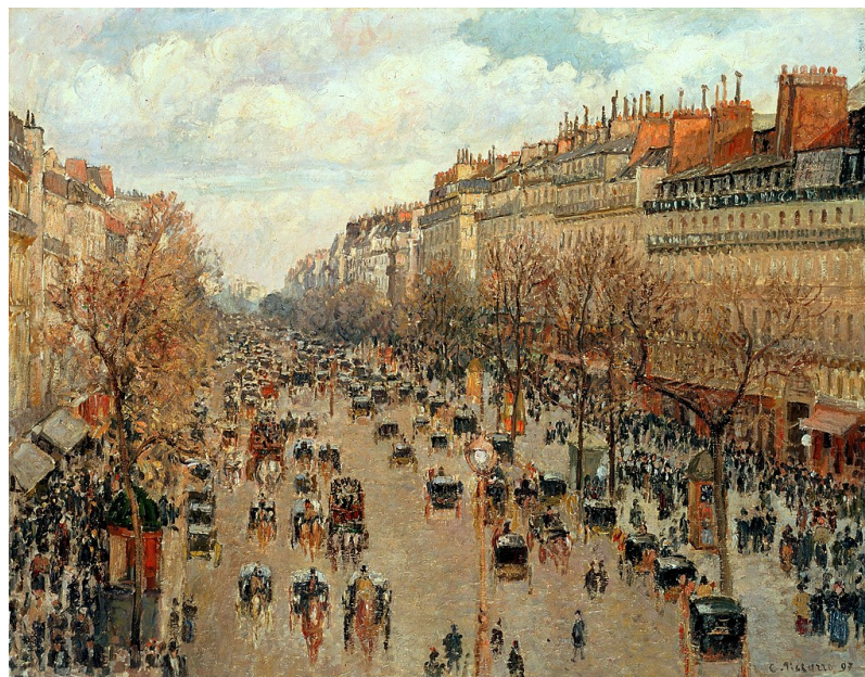
Figure 2. Camille Pissarro, Boulevard Montmartre Afternoon Sunshine , 1897, oil on canvas, 74 x 92.8 cm., Hermitage Museum, Saint Petersburg, Russia