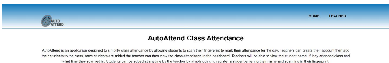
Figure 5 Home View

The home view of our website will have a description of the website and a summary of how it works. It will also include links for the teachers and students to get to their pages. This view will be simple and easy to navigate, as it will be available to all users. This will be the first page they see, so users can get an idea of how AutoAttend is set up, and what they need to do to get started.