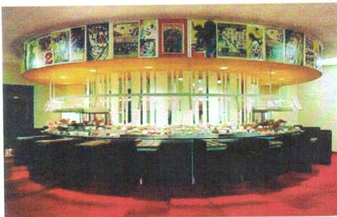
Circl-Serv Model CS-23 at the University of Wisconsin (Madison, WI)

In fact, with the wheel divided into thirds, a patron can make his selection in seconds. In that time, a complete menu will have come past a customer station — soup, casseroles, entrees and vegetables, warmed constantly by travelling overhead heaters, while salads, beverages and cold desserts are in the chilled section. Sandwiches, pastries and other snacks are carried in adjoining room temperature sections.