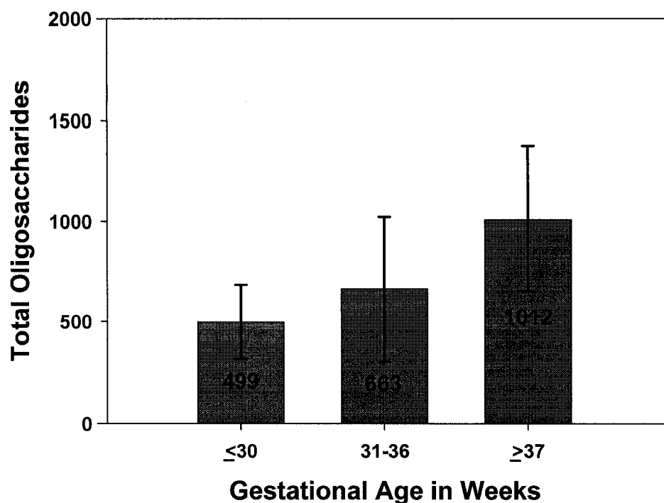
Figure 1. Mean Total Fucosylated Oligosaccharide Concentration by Gestational Age

The oligosaccharide concentration in the colostrum and mature milk of mothers of term infants is high and gradually decreases over the first few months of lactation (Coppa et al., 1993). Since these oligosaccharides have been associated with the protection of infants against infectious disease, the high oligosaccharide content in human milk at birth suggests that human milk is uniquely designed to protect infants when they are most susceptible to infection. These observations, along with the evidence that a number of other factors such as secretory IgA, nitrogen, sodium, and chloride differ in preterm and term milk, have led investigators to postulate that the oligosaccharide concentration in preterm milk may be higher than it is in term milk, thereby offering greater protection to preterm infants.